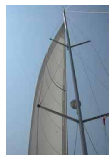
Leech trim, closed hauled and with full size sail. Note Mainsail is furled for ease of viewing.

With the genoa furled to the third 'reefing' mark the car should be moved forward until the front of the car is 6'6" /1981 mm aft of the outer shroud. Conditions requiring this third reef will be quite windy and depending on your comfort level may be put in place anywhere from 16 knots on up. This position will keep the foot of the sail quite tight, flattening the sail for good breezy performance.