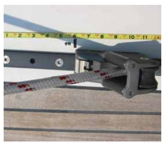
Car location when reefed to the second mark. Note the #2