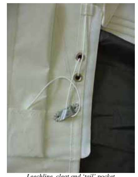
Leechline, cleat and 'tail' pocket

The first photo shows the leechline pocket opened to reveal the leechline, snubbing eyes, cleat and the 'tail' pocket. The snubbing eyes help to take the load from the line making cleating and un-cleating an easy task. The 'tail' pocket is on the inside of the leechline cover and you can put the excess leechline tail into this pocket before closing the cover. To adjust, take up the line by pulling downward just above the eyelets, taking up the slack in the line just below the cleat. Pull the line until the flutter stops. Cleat the line and insert the tail into the pocket and close the flap.