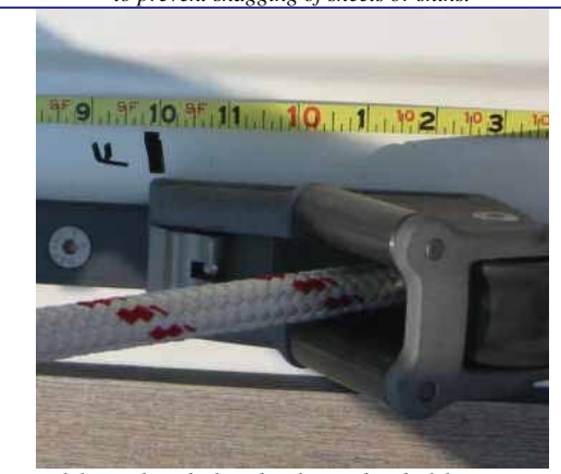
Mark located on deck and at forward end of the genoa car Note the lifting lever at the front of the car

now smaller sail. In marking the location of the cars so that they coincide with the reefing marks at the tack of the genoa you will take the guesswork out of setting the leads when reefing. The lazy genoa car can quickly and easily be moved forward to the premarked location and then during a slow tack the genoa is reefed to the coinciding mark at the tack. The sail trim will be properly set on the new tack. When measuring the lead positions (as described below) we suggest that you mark the track at the forward edge of the genoa car. You can do this with permanent marker, tape or some sort of self-adhesive 'dots'. The marks should be on the deck as track mounted tape/marks can be rubbed off by the car.