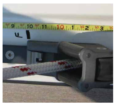
Track location with full size sail and 'F' for full size