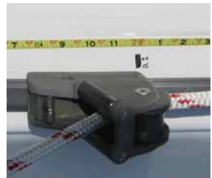
Car location when reefed to first mark. Note the 'R1' designation