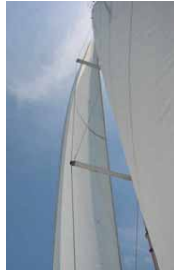
Leech trim, closed hauled and with full size sail

With the genoa furled to the second and deepest 'reefing' mark, the lead car should be moved forward until it is 5'-5" / 1651mm aft of the outer shroud. Conditions that require this third reef will be quite windy and depending on your comfort level may be put in place anywhere from 16 knots on up. This position will keep the foot of the sail quite tight, flattening the shape for good breezy performance.