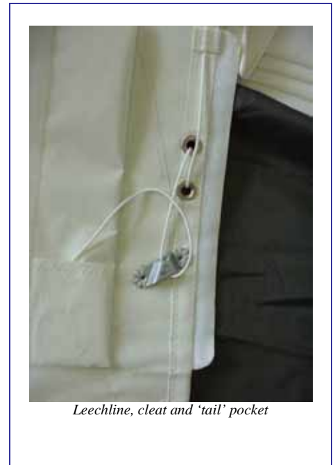
Leechline, cleat and 'tail' pocket

The first photo shows the leechline pocket opened to reveal the leechline, snubbing eyes, cleat and the 'tail' pocket. The snubbing eyes help to take the load from the line making cleating and un-cleating an easy task. The 'tail pocket' is on the inside of the leechline cover and you can put the excess leechline tail into this pocket before closing the cover. To adjust, take up the line by pulling downward just above the eyelets, taking up the slack in the line just below the cleat. Pull the line until the flutter stops. Cleat the line and insert the tail into the pocket and close the flap.