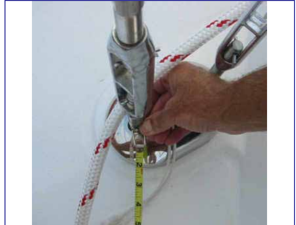
Measuring aft from the shroud base

You will find that once the initial trim settings are made to the genoa lead (car) position (which is critical to good performance) the cars will not require much movement fore and aft for different conditions. However, as one reefs the headsail smaller and smaller, the sail moves forward and the clew elevates slightly as a result. This changing dynamic requires that we adjust the genoa lead position to ensure proper trim when sailing with this now smaller sail. In marking the location of the cars so that they coincide with the reefing marks at the tack of the genoa you will take the guesswork out of setting the leads when reefing. The lazy genoa car can quickly and easily be moved forward to the pre-marked location and then during a slow tack the genoa is reefed to the coinciding mark at the tack. The sail trim will be properly set on the new tack. When measuring the lead positions (as described below) we suggest that you mark the track at the forward edge of the genoa car. You can do this with permanent marker, tape or some sort of self-adhesive 'dots'. The marks should be on the deck as track mounted tape/marks can be rubbed off by the car.