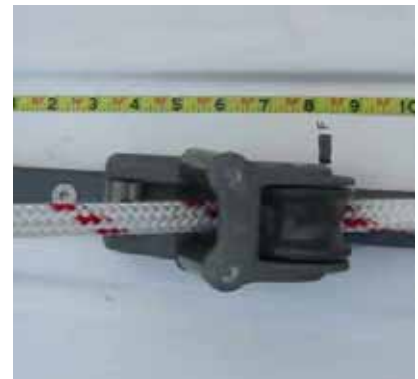
Track location with full size sail and 'F' for full size