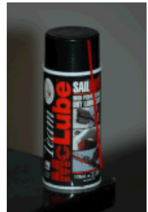
Spray the silicone spray for the main loop If you spray McLube on the wind telltales they will not glue on the sail while raining