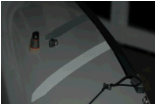
Grip tape for the crew