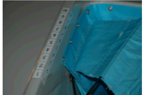
Marks for the jib setting