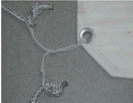
Use a second line to get the haul point of the barber hauler a little bit more back like at this photo