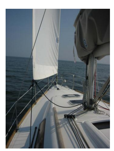
Genoa furled to first tack reefing mark