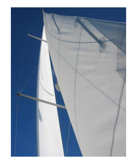
Leech trim, closed hauled and with full size sail. Note location of leech at each spreader

Occasionally, you might find that the leech flutters a bit. If this happens, it's usually that the sheet tension is not tight enough (you need to winch the sail in a bit tighter). However, if the boat becomes over-powered (heeling excessively), you should consider reefing the sail at this time. Assuming you have the leads in the right location and the sheet tension is correct, but the sail still has a bit of flutter, you should adjust the leechline to keep the leech from fluttering. The following photo shows the leechline pocket opened to reveal the leechline, snubbing eyes, cleat and the 'tail' pocket. The snubbing eyes help to take the load from the line making cleating and un-cleating an easy task. The 'tail pocket