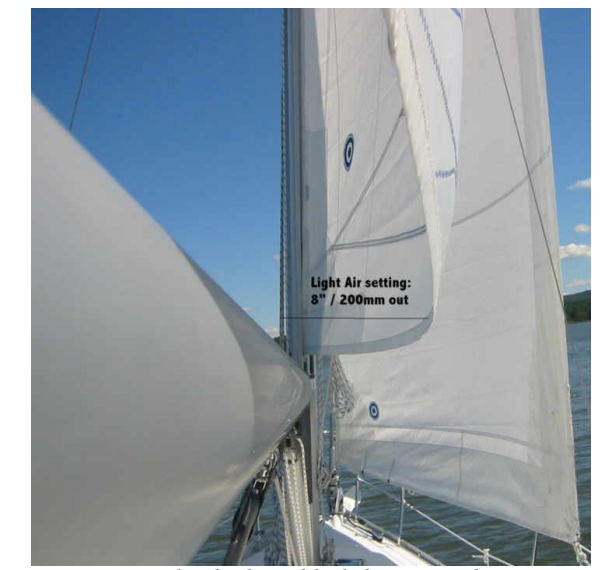
Mainsail outhaul eased for light air upwind trim