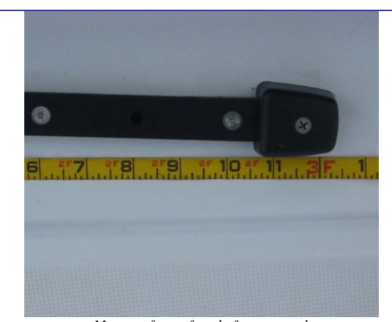
Measure\ from\ aft\ end\ of\ genoa\ track

In marking the location of the cars so that they coincide with the reefing marks at the tack of the genoa you will take the guesswork out of setting the leads when reefing. The lazy genoa car can quickly and easily be moved forward to the pre-marked location and then during a slow tack the genoa is reefed to the coinciding mark at the tack. The sail trim will be properly set on the new tack. When measuring the lead positions (as described below) you need to mark the track at the forward edge of the genoa car. You can do this with permanent