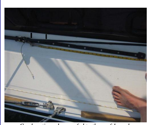
Car location when reefed to the reef 1 mark. Note both marks on the deck for full size and reef 1

is on the inside of the leechline cover and you can put the excess leechline tail into this pocket before closing the cover. To adjust, take up the line by pulling downward just above the eyelets, taking up the slack in the line just below the cleat. Pull the line until the flutter stops. Cleat the line and insert the tail into the pocket and close the flap.