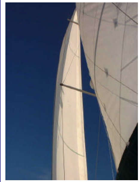
Leech trim, closed hauled and with full size sail

As you might have noticed, the movement forward of the cars aren't equal distances. This is because as you furl the sail the clew moves forward and also higher up , which offsets the movement forward.