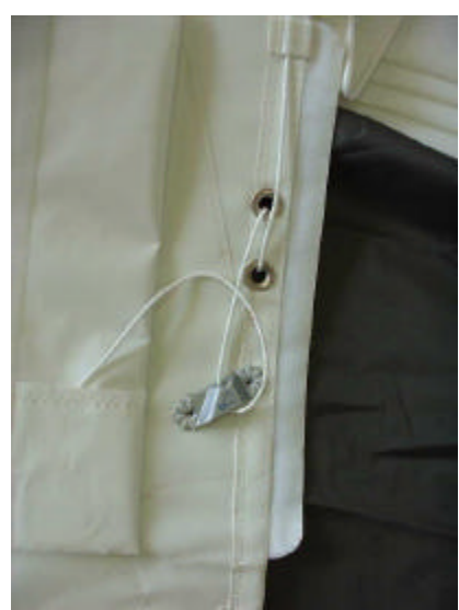
Leechline, cleat and 'tail' pocket

The first photo shows the leechline pocket opened up to reveal the leechline, snubbing eyes, cleat and the 'tail' pocket. The snubbing eyes help to take the load from the line making cleating and nucleating an easy task. The 'tail pocket is on the inside of the leechline cover and you can put the excess leechline tail into this pocket before closing the cover