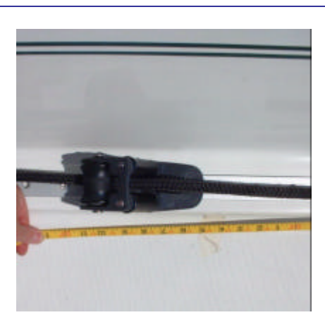
Car location with sail reefed to the first tack mark