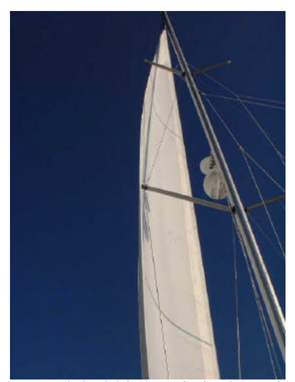
A genoa completely unfurled and trimmed up for sailing upwind in about 8 knots of breeze. You can see that it is just inside the upper spreader and a few inches off the lower spreader.